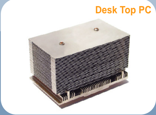
Desk Top PC