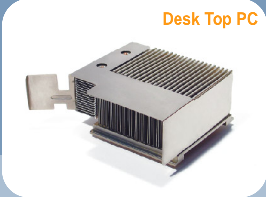
Desk Top PC