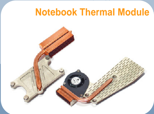
Notebook Thermal Module